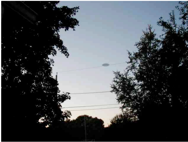
UFO over Neenah, Wisconsin

world, let us consider the energy requirements for aliens to travel to Earth. The formula would be: