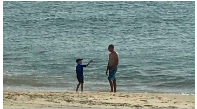
Nags Head Beach, North Carolina. "Dad, was this created by God or by accident by evolution?"; used by permission