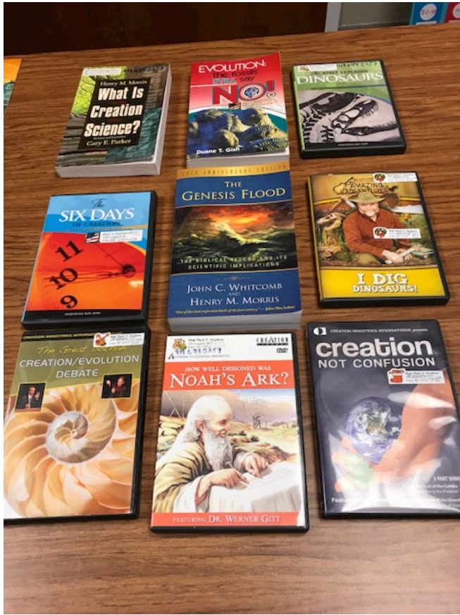
Sampling of creation/creation science materials