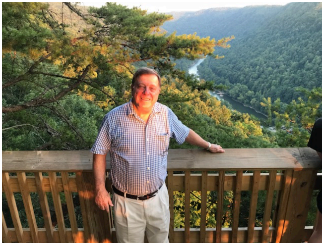
New River Gorge: coal town and railroad at bottom around 1900

who have believed in Him and remained faithful to Him (Romans 8:18–23).