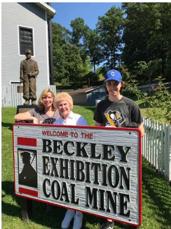
Three generations including Gen Z; used by permission